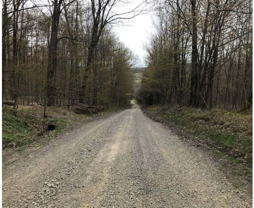
Before Road Fill