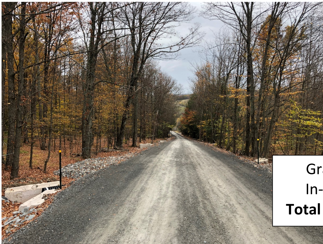
After 6' Road Fill

Grant: $213,728.52 In-Kind: $23,800.55 Total Value: $237,529.07