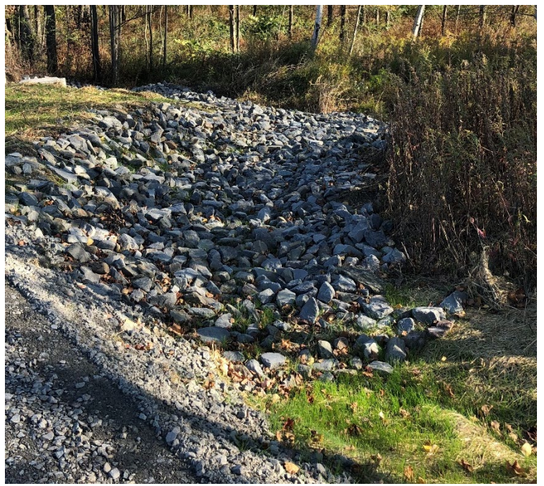
Rocked Turn Out